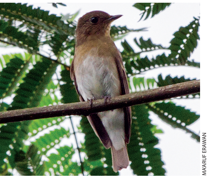
Plate 6. Female Zappey's/Blue-and-white Flycatcher with strong contrast between breast and belly, Turgo Hill, Gunung Merapi National Park, 8 March 2014.