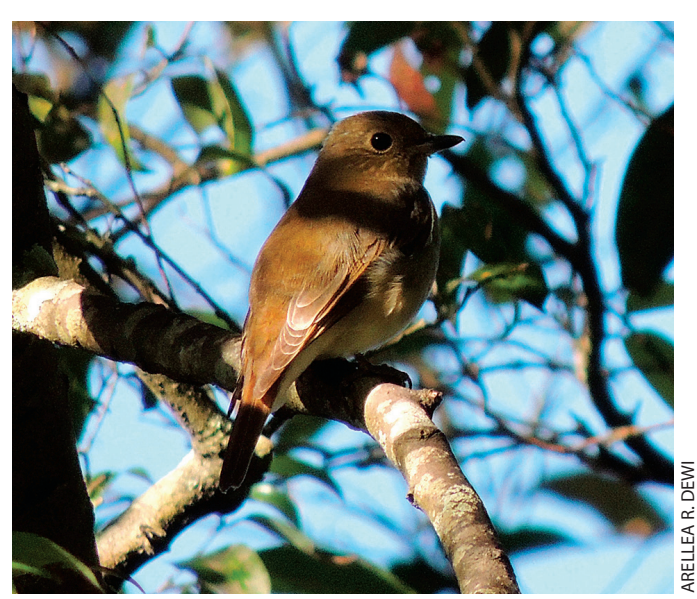
Plate 4. Female Zappey's/Blue-and-white Flycatcher, Cibodas Botanical Gardens, 17 March 2015.