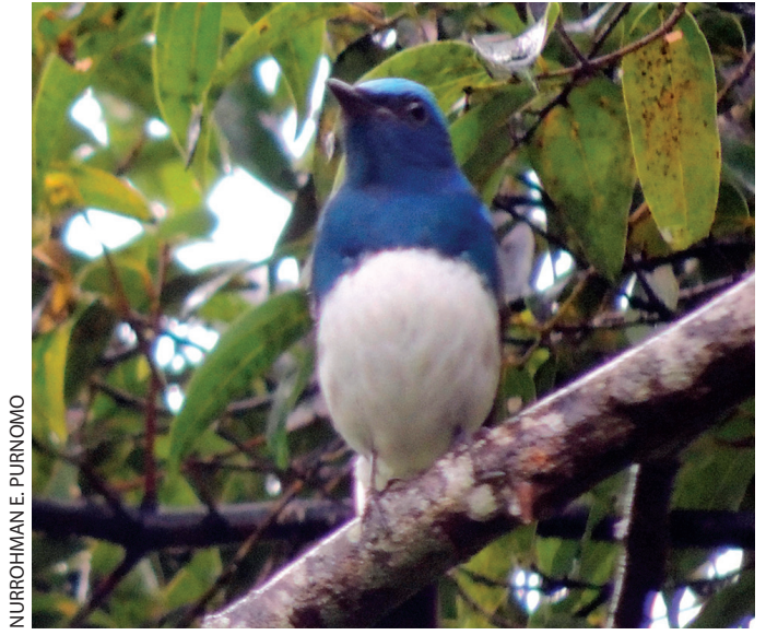
Plate 2. Ventral view of the same bird, Cibodas Botanical Gardens, 20 March 2015.