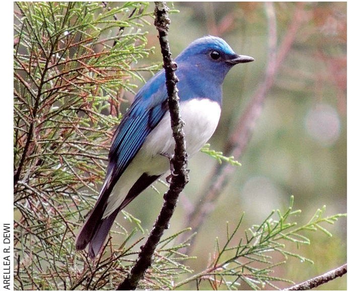
Plate 1 . Lateral view of adult male Zappey's Flycatcher Cyanoptila cumatilis , Cibodas Botanical Gardens, Java, Indonesia, 20 March 2015.