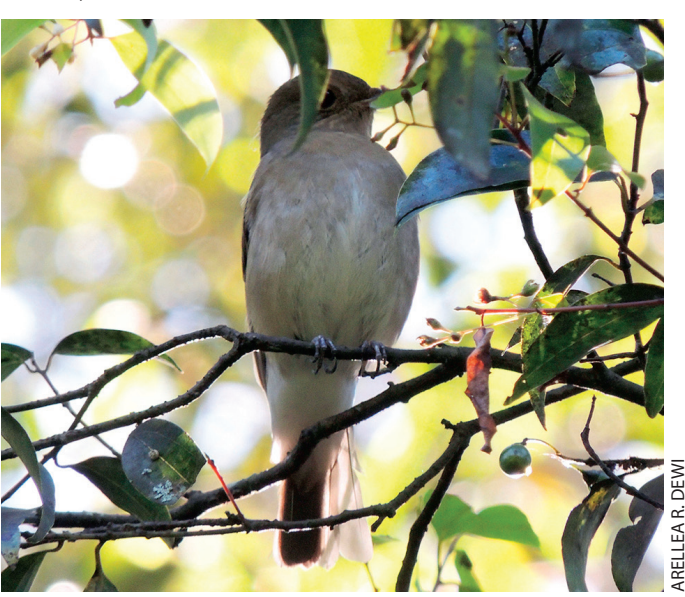
Plate 5 . Female Zappey's/Blue-and-white Flycatcher with gradation from breast to belly, Cibodas Botanical Gardens, 17 March 2015.