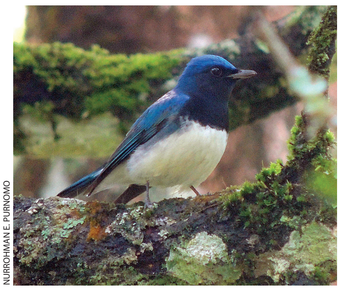
Plate 3 . Adult male nominate Blue-and-white Flycatcher C. cyanomelana , Cibodas Botanical Gardens, 16 March 2015.