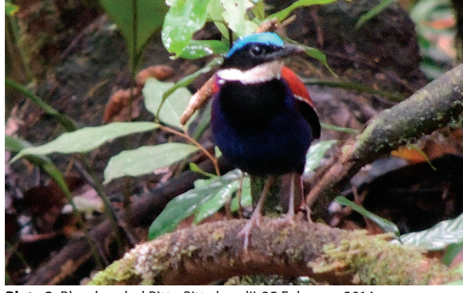
Plate 3. Blue-headed Pitta Pitta baudii, 25 February 2014.