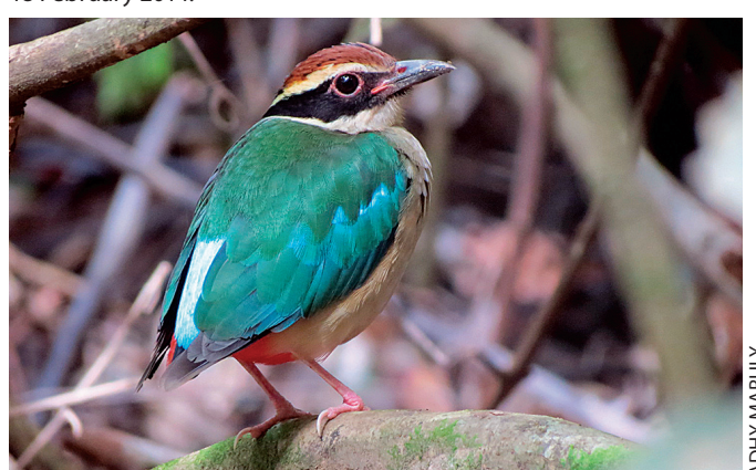
Plate 4. Fairy Pitta Pitta nympha,15 March 2013.