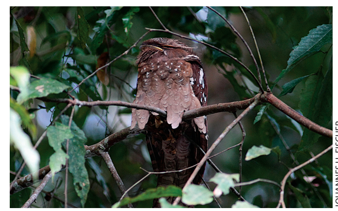
Plate 2 . Large Frogmouth Batrachostomus auritus on nest, 18 February 2014.