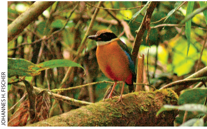
Plate 5. Blue-winged Pitta Pitta moluccensis,10 February 2014.