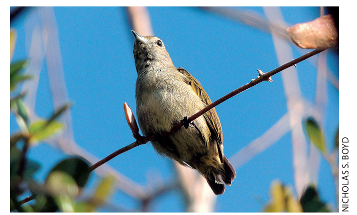
Plate 8. Plain Flowerpecker Dicaeum minullum, 6 March 2015.

\label{lem:all-images} \textbf{All images were taken in Bukit Batikap Protection Forest, Central Kalimantan, Indonesia.}