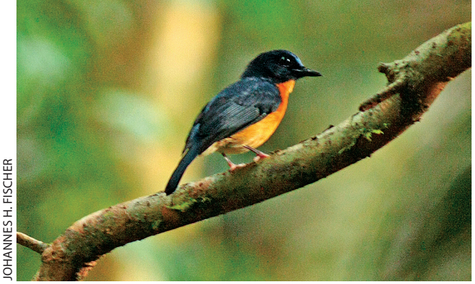
Plate 7. Male Large-billed Blue Flycatcher Cyornis caerulatus , 16 April 2014.