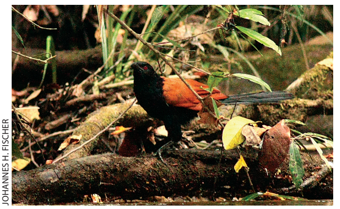
Plate 1. Short-toed Coucal Centropus rectunguis, 22 April 2014.