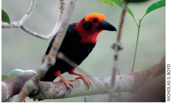
Plate 6 . Bornean Bristlehead Pytiriasis gymnocephala , 3 April 2015.