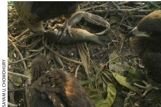
SAYAM U. CHOWDHURY