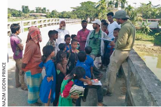
NAZIM UDDIN PRINCE