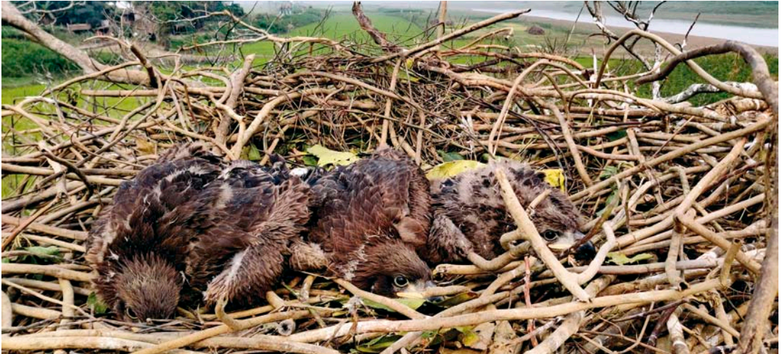
Plate 4. Eagle chicks at the nest, January 2020.