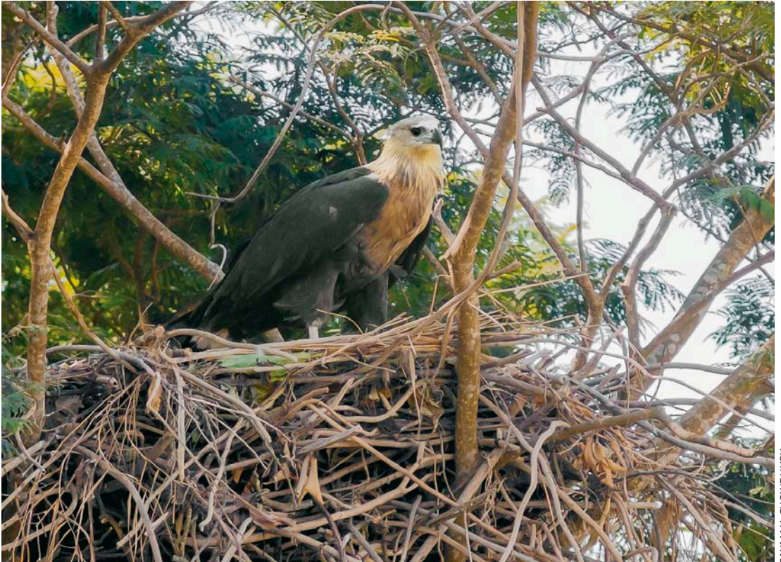
Plate 1. An adult Pallas's Fish-eagle Haliaeetus leucoryphus at the nest, north-east Bangladesh, December 2017.

With support from the Oriental Bird Club, we: 1) conducted large-scale community-based interview surveys to identify Pallas's Fish-eagle nests in Sunamganj and Netrokona districts of the Sylhet Division in north-east Bangladesh; 2) determined immediate threats to Pallas's Fish-eagles in the region; 3) studied its nesting habitat preferences and diet; and 4) initiated a nest guardian scheme.