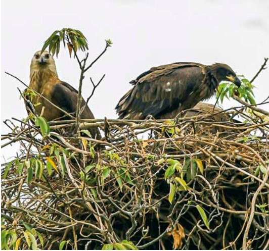
Plate 2. Adult and chicks at the nest, December 2017.