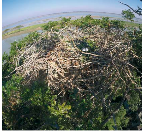
Plate 3. Bird's-eye view of a Pallas's Fish-eagle nest, December 2017.